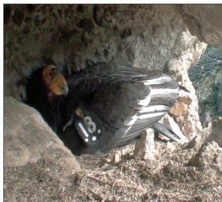
Condor 318 on this year's nest in Pinnacles National Monument.