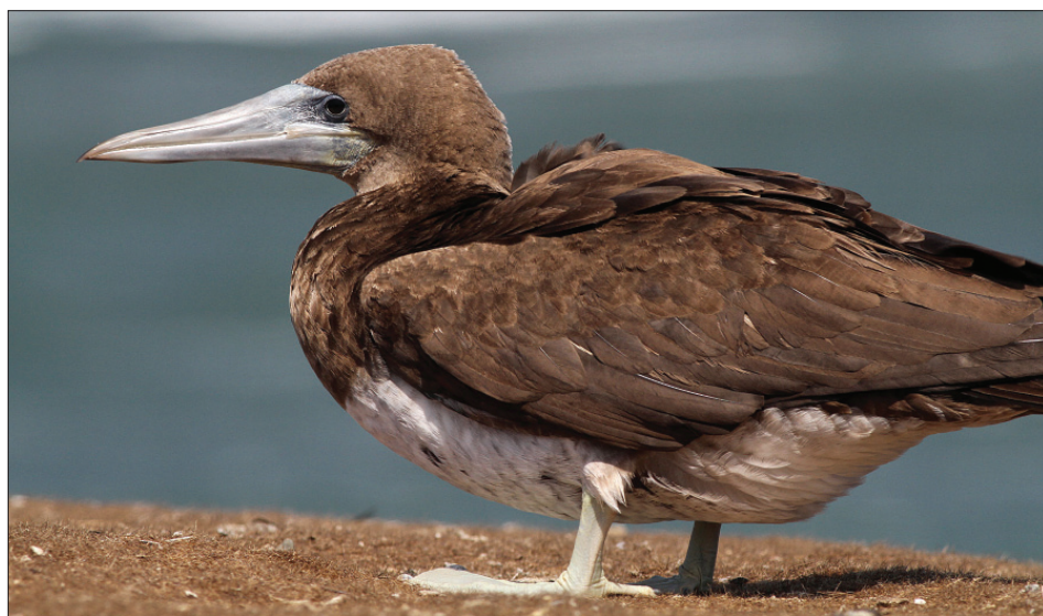
Brown Booby on Año Nuevo Island, San Mateo.

Glaucous Gulls were reported from Salt Pond A16, SCL (mob); S. L. Merced, SF (CH); Great Highway, SF (PSa); and Pigeon Pt., SM (RT). A Black-legged Kittiwake was