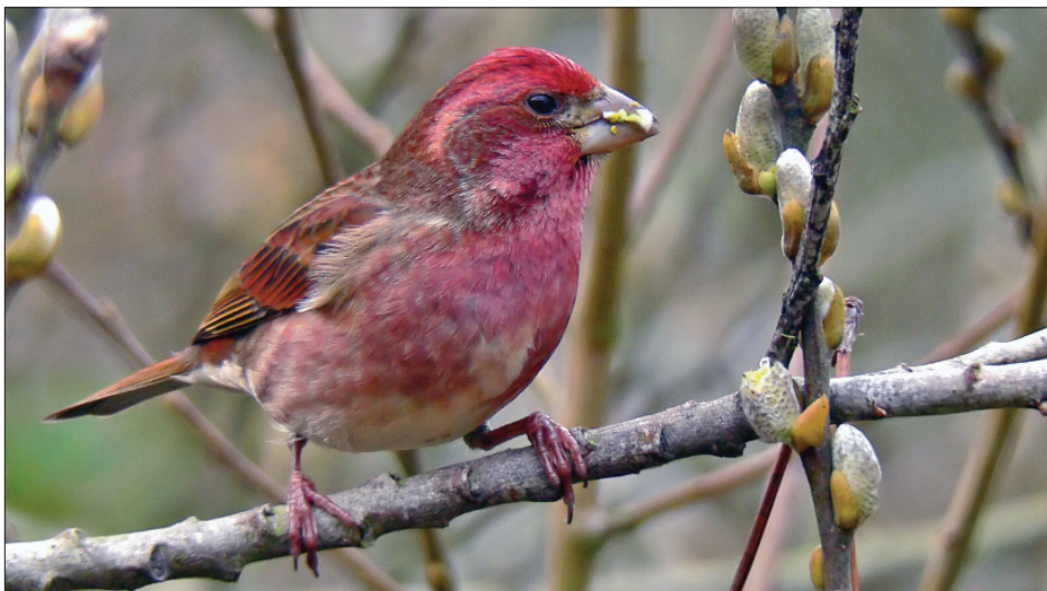
Purple Finch at the San Francisco Botanical Garden.

Spaces may still be available on these trips offered exclusively to Golden Gate Audubon Supporting Members. Each trip is limited to 10 participants. We can expect to see numerous breeding birds, including Pigeon Guillemots and Brandt's and Pelagic Cormorants. Birders need to meet at 8:30 a.m. to board the ferry. The trip ends at 11 a.m., though we may stay on the island later.