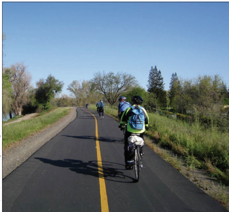
Want to join the Birdathon but don't want to drive? Get together a team to bird by bike.

Don't miss your chance to participate in Birdathon 2010. Please help us reach our goal of raising $20,000 to support Golden Gate Audubon's important education and conservation programs. Register today!